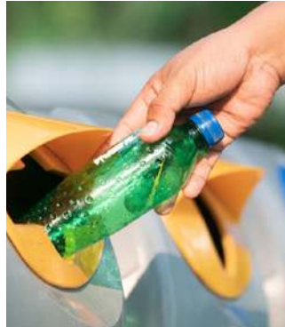
Post-consumer-plastic from collected plastic bottles